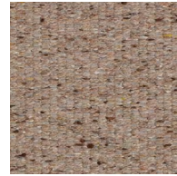
21702 Dark Blush